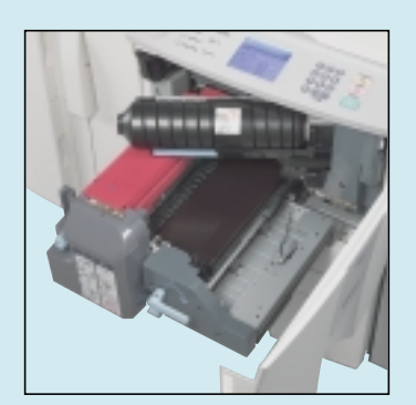
Unique modular service kits minimize service downtime, and protect your investment.

The 4,000-sheet large capacity tray increases the online paper to an impressive 7,600 sheets.